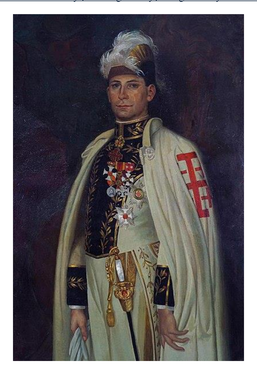
Wikimedia Knight of the Order of the Holy Sepulcher of the Holy See, ca., 1900 Immagine scannerizzata da "Ordini cavallereschi e cavalieri", di Arnone, C, 1954

"What is the smallest country [sovereign entity] recognized by international law?"