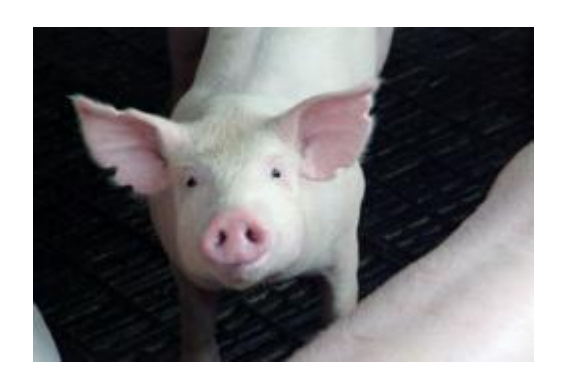
Taste of China, Part 2,

is unclean to Muslims. It surely would not be found on their dining table. Conflict is inevitable when these two values meet. The scene is set in Malaysia, home to 12 million Muslims and 6 million Chinese. A group of Chinese who make their living in the pig business confronts Muslims who are forbidden to eat pork; Chinese Muslims are often caught in the crossfire. What is the solution to this deep-rooted ethnic dilemma?"